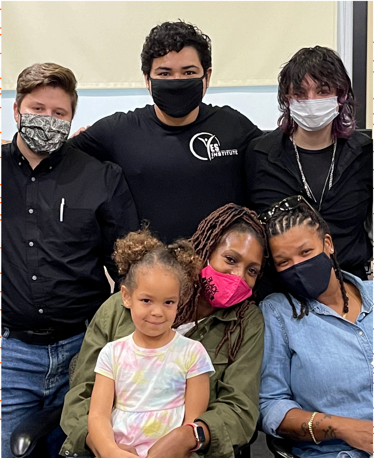
YES Institute / Youth & Family Resilience Initiative