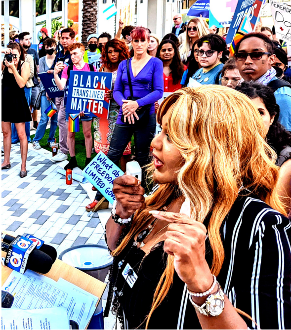
Transinclusive leader addresses crowd at protest